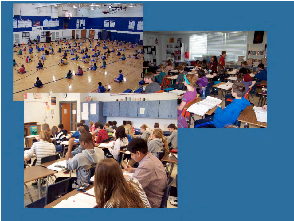
This is picture of current classrooms.