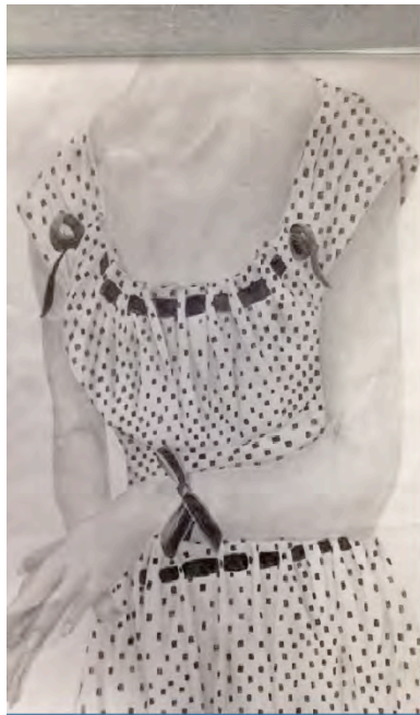
Drawing by Abby Old